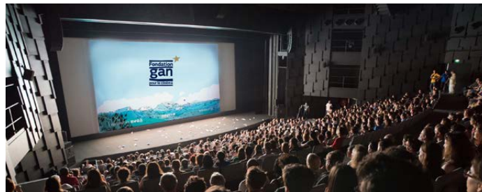
Anecny International Animation Film Festival

Historically a provider of insurance services for professional players, Gan Assurances is today an insurer for all «enterprising» people in both their private and professional lives.